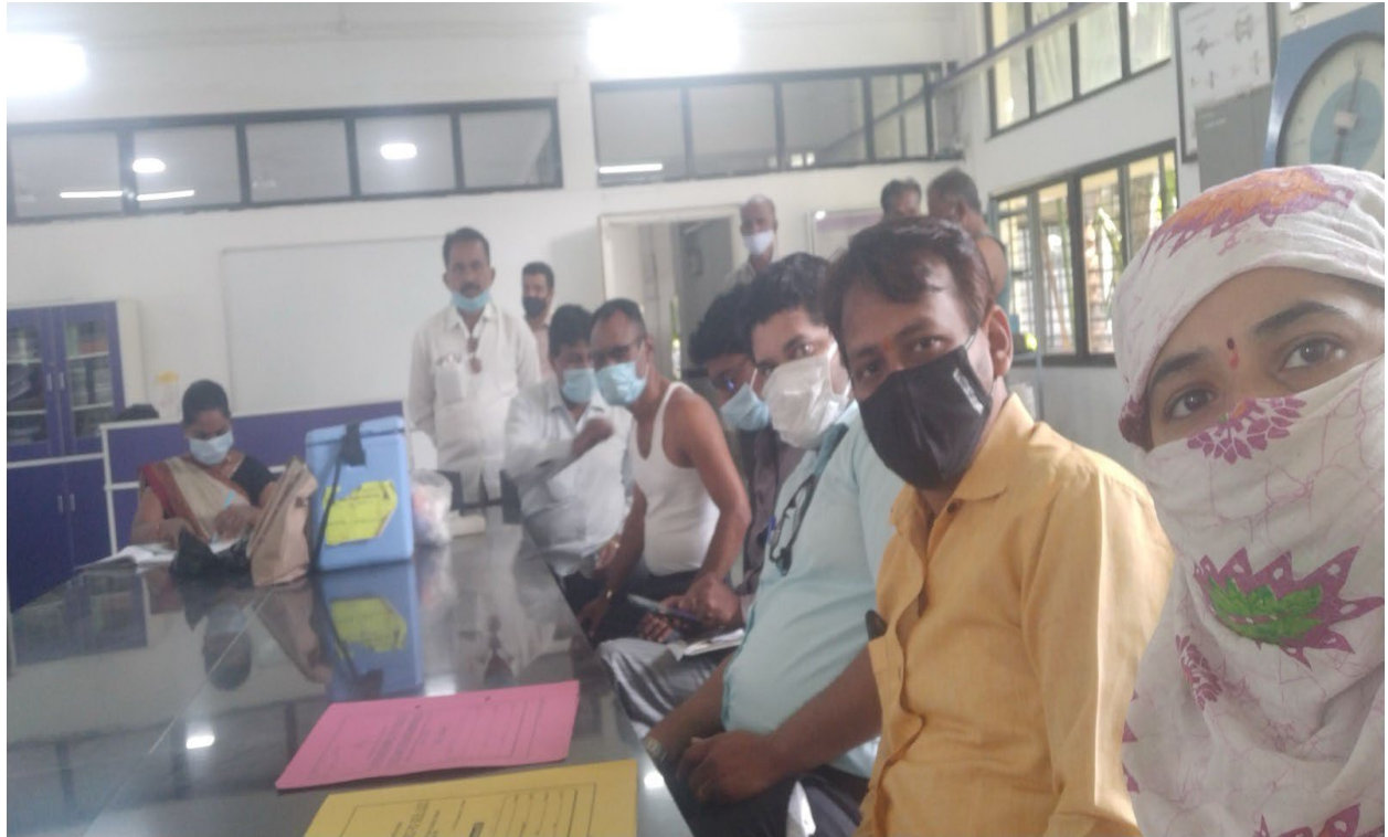
COVID-19 VACCINATION CAMP