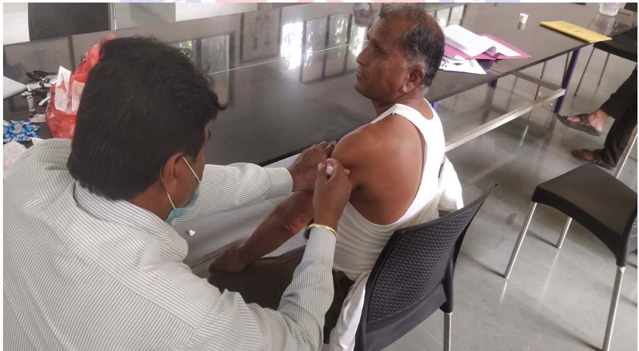
Vaccination by Doctor